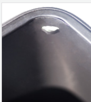
Step 1: Locate slot opening in corner