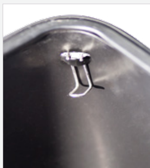
Step 3: "J" portion of hook should point to center