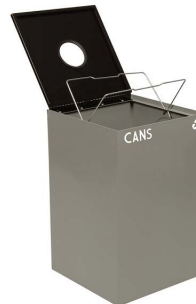
Bag holder clips