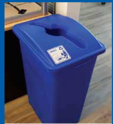
Multiple lids available

The Bulk Discount Waste Container Experts Call us for Quantity Discounts and Custom Designs!