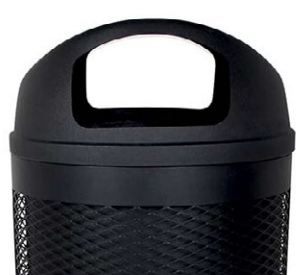
Dome - Black

Canopy Lid Bin Dimensions: 23" Diameter x 46" H