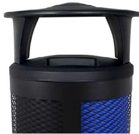
Canopy - Double