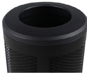
Single - Black