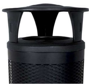
Canopy - Single

Flat Top Dimensions: 23" Diameter x 37.5" H