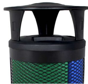
Canopy - Triple

Canopy Lid Bin Dimensions: 23" Diameter x 46" H