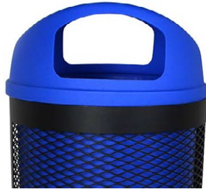
Dome - Blue

Dome Lid Bin Dimensions: 23" Diameter x 49" H