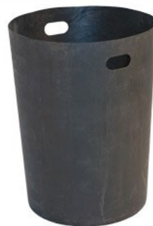
36-gal plastic liner