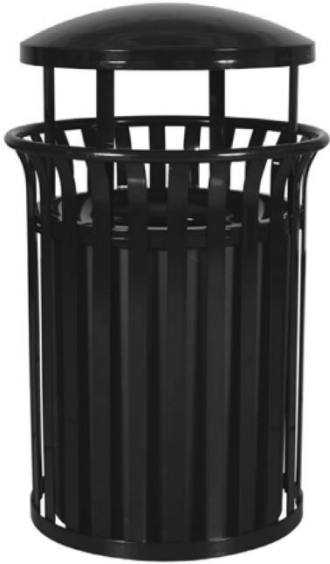
CLASSIC: SCD-2633 BLK