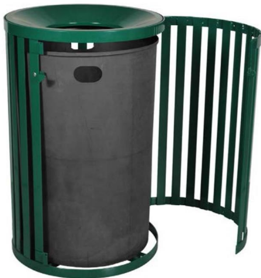
SOUTH HAMPTON: SCTP-40 HGR