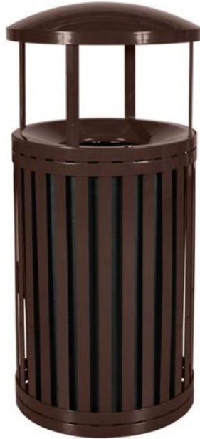
EAST HAMPTON: Sctp-40 D ND COF