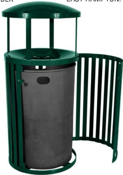
SOUTH HAMPTON: Sctp-40 D HGR