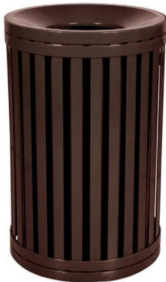
EAST HAMPTON: SCTP-40 ND COF