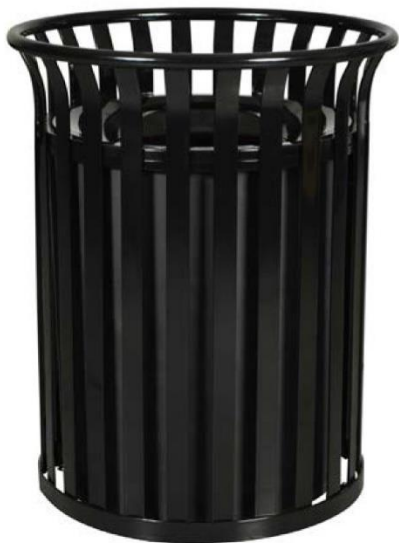
CLASSIC: SC-2633 BLK