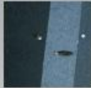
Pocket Screw Joinery