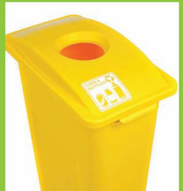
Custom colors available