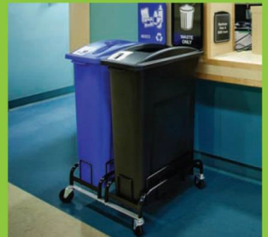
Optional Wheel Dollies