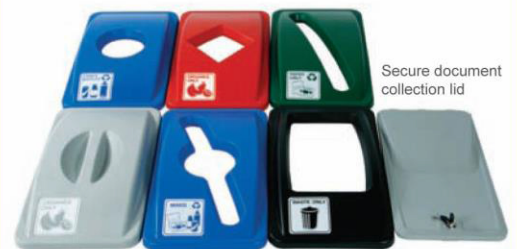
Variety of lids available in many colors