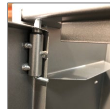
Stainless steel pivot-hinged doors