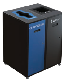
23 Gal Double