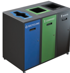
23 Gal Triple