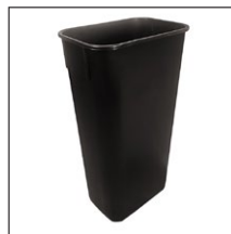
Plastic liners included