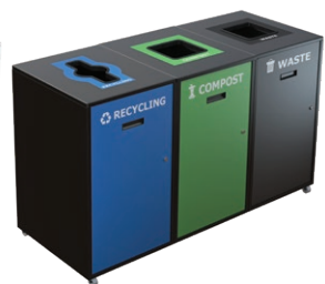
31 Gal Triple