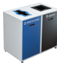
31 Gal Double