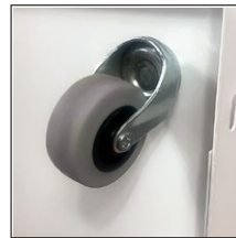
2" rubber casters