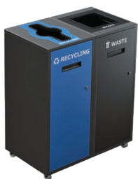
15 Gal Double