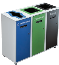
15 Gal Triple