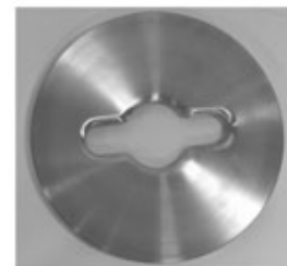
Recycling Lid for the #782729