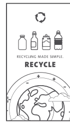
15.375"w x 26.5"h