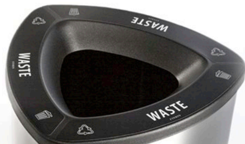
Sorting labels included