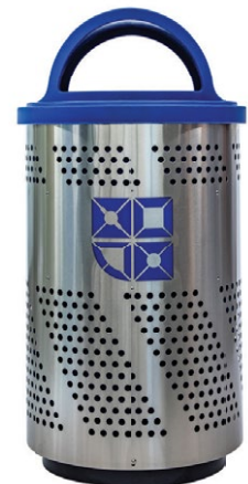
Custom logos available!

The Bulk Discount Waste Container Experts