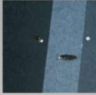
Pocket Screw Joinery